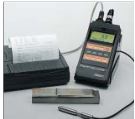
FERITSCOPE® MP30 for standardized non-destructive measurement of the ferrite content in austenitic welded products or in duplex steel.

The high quality standard of FISCHER instruments is the result of our efforts to provide the very best instrumentation to our customers.