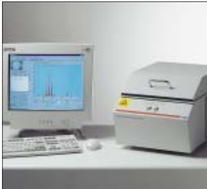
FISCHERSCOPE® X-RAY XAN energy dispersive spectrometer for quantitative material analysis from Al(Z=13) to U(Z=92).

to the X-ray fluorescent, Beta Backscatter, magnetic induction, eddy current and coulometric methods. Additionally, the program includes instruments for measuring micro-hardness, ferrite content, and porosity testing. FISCHER is active around the world. Instruments manufactured by our company are used in many countries. FISCHER has subsidiaries in eight different countries.