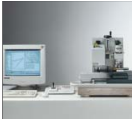
FISCHERSCOPE® H100C with WIN-HCU® for the measurement of the microhardness HM according to DIN EN ISO 14577 and DIN 55676.